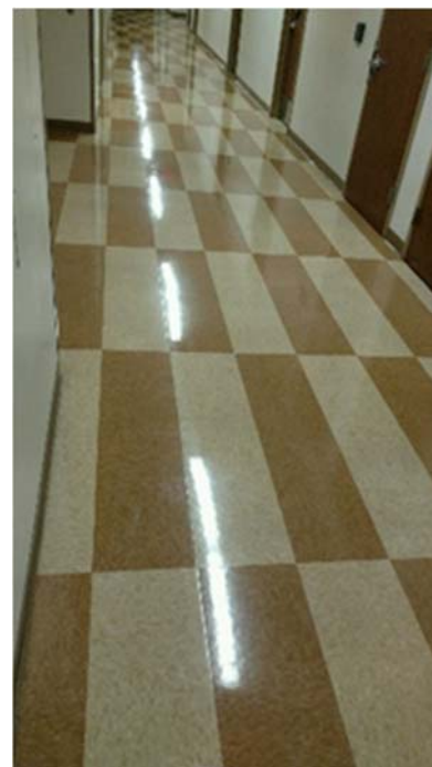
PPD Custodial Services' Floor Crew make the floors shine.