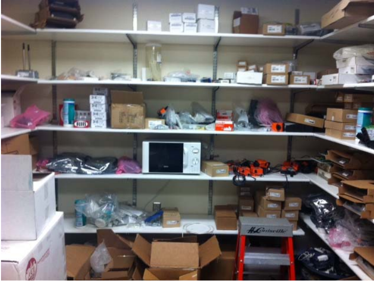
The north storage room in PPD Engineering & Energy Services before Acacia's organization.

(Continued) The system will charge the item scanned to the work order and deduct the item from the inventory. Just by going that extra mile and setting up bar codes helps our group run more efficiently and be more productive.