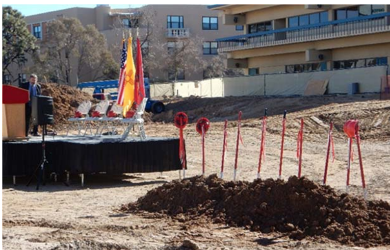
Special Activities staff made sure that everything was in its place as the Groundbreaking ceremony begins.

To read more about this event, click here .