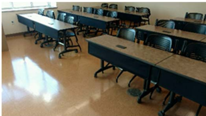
Shiny, clean floors in a classroom at the Science & Math Learning Center.