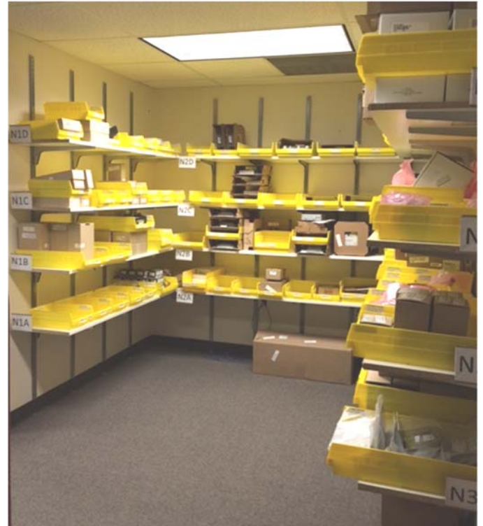
After the north storage room received a makeover.