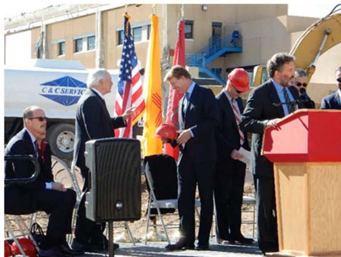
Dignitaries gather on the stage for the McKinnon Center for Management groundbreaking ceremony.