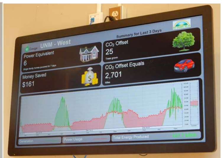
This dashboard shows that the UNM West solar array is providing a power equivalent of six residential homes powered for seven days, and avoiding costs in the amount of $161. This summary was for the last three days when this photo was taken.